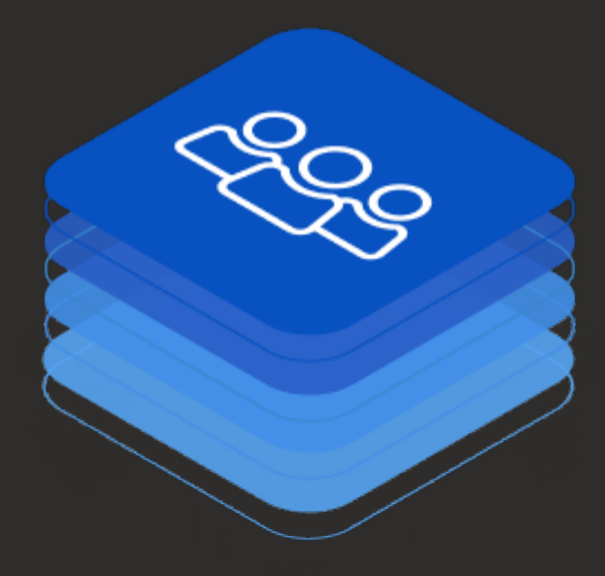
Business Partner KIT All updates available in the KIT