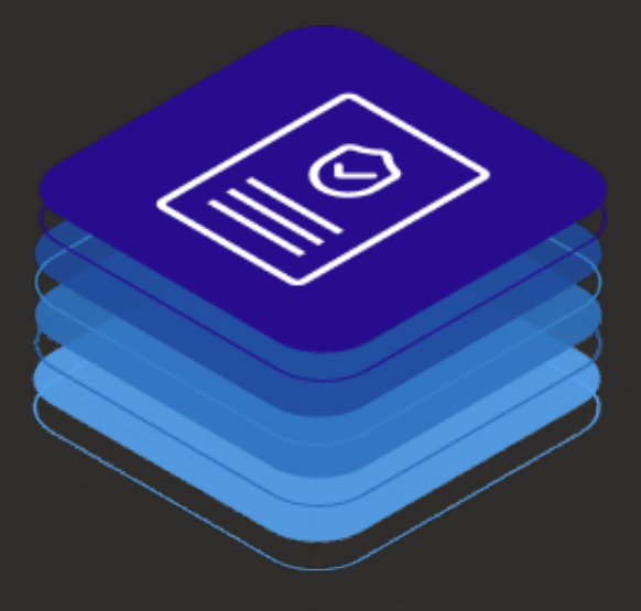
Certificate Management KIT All updates available in the KIT